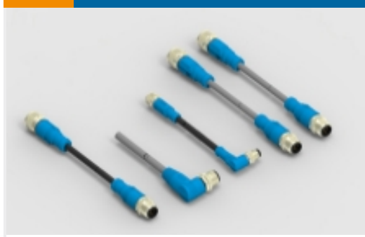
M8/M12 Cable Assemblies(135)